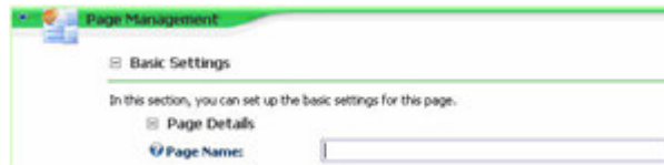
Figure: Menu Item dialog box