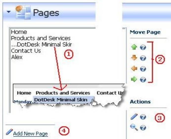
Figure: Pages module with management buttons