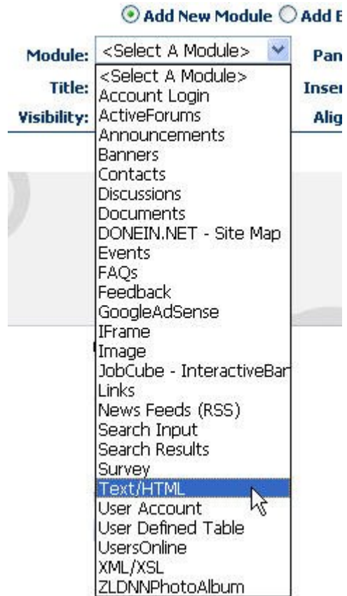
Figure: Select Text/HTML from Module Menu drop down list