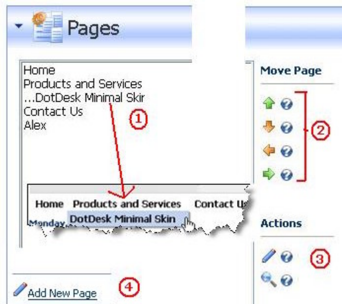
Figure: Pages module with management buttons